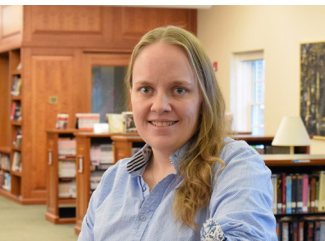
Your College Counselor, empowering your future vision