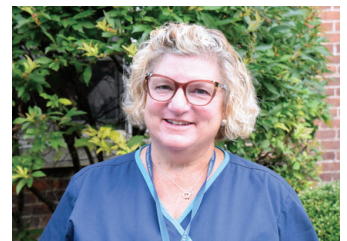
Your Nurses and Counselors, with the care you need