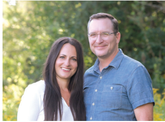
Your Family, supporting your growth from home