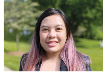
Your Proctors, senior leaders who help you manage everyday routines