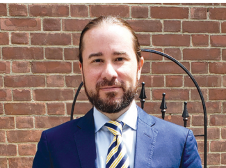
Your Advisor, the point person for your Personal Team