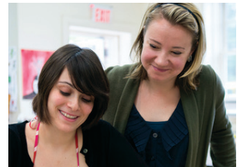
Dorm Parents, overseeing all aspects of dorm life