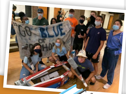
Home AWAY FROM Home