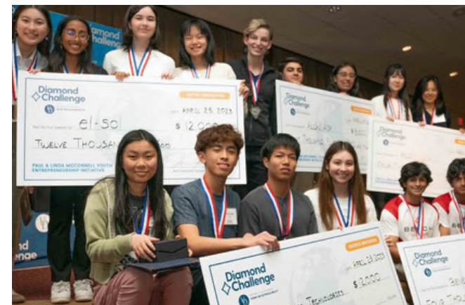
Pictured above: Our students, the Champion team of The Global High School Innovation and Business Competition 2023.