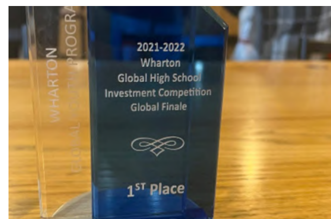
The Championship Winners of The Global High School Investment Competition of 2022.