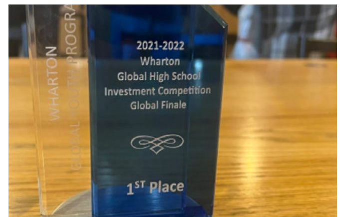
The Championship Winners of The Global High School Investment Competition of 2022. Advised by Viswise instructors.