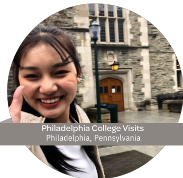
Philadelphia College Visits Philadelphia, Pennsylvania