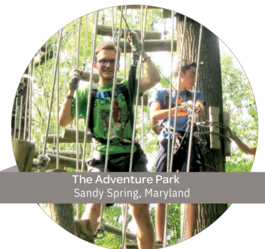
The Adventure Park Sandy Spring, Maryland