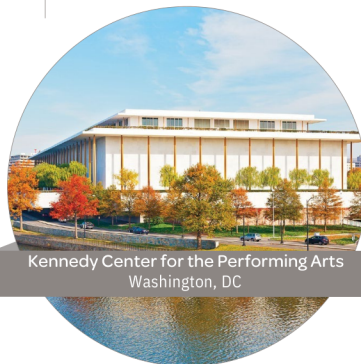
Kennedy Center for the Performing Arts Washington, DC