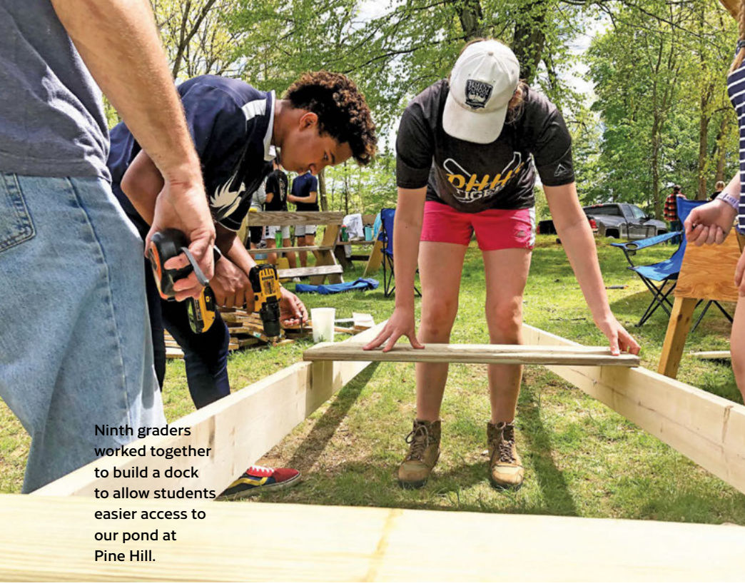
Ninth graders worked together to build a dock to allow students easier access to our pond at Pine Hill.