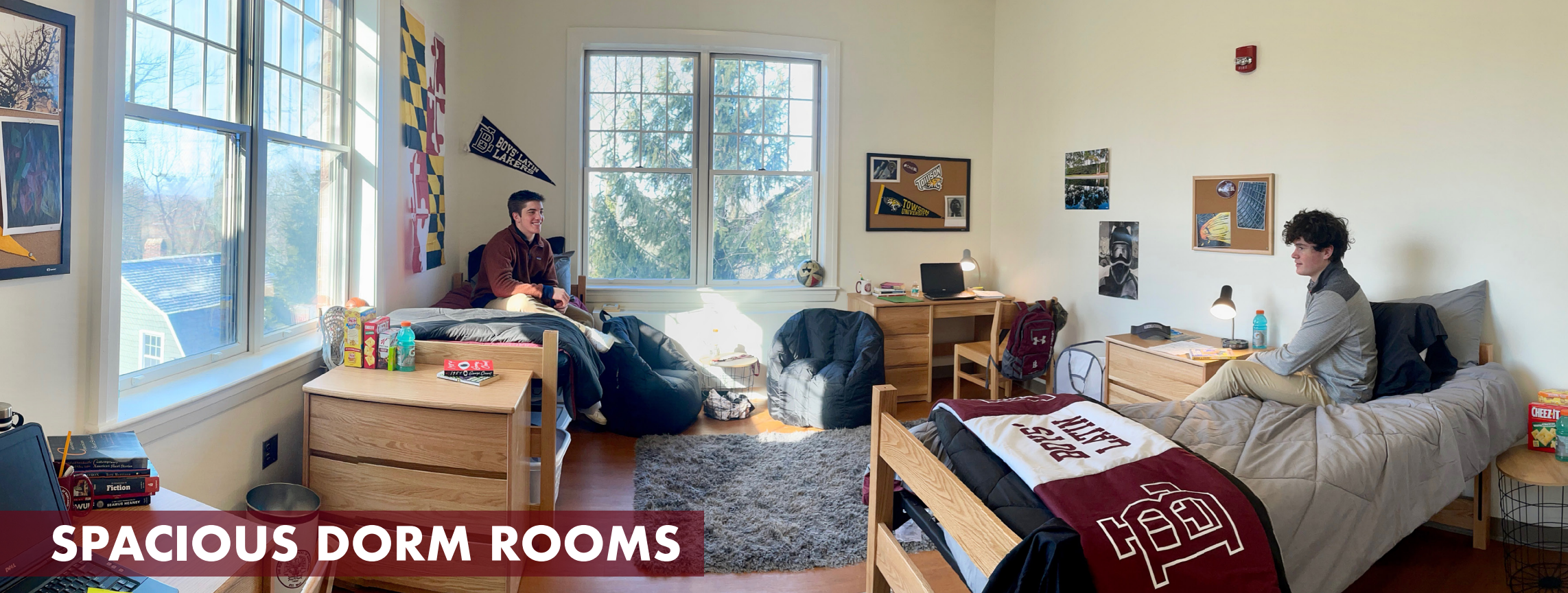
SPACIOUS DORM ROOMS