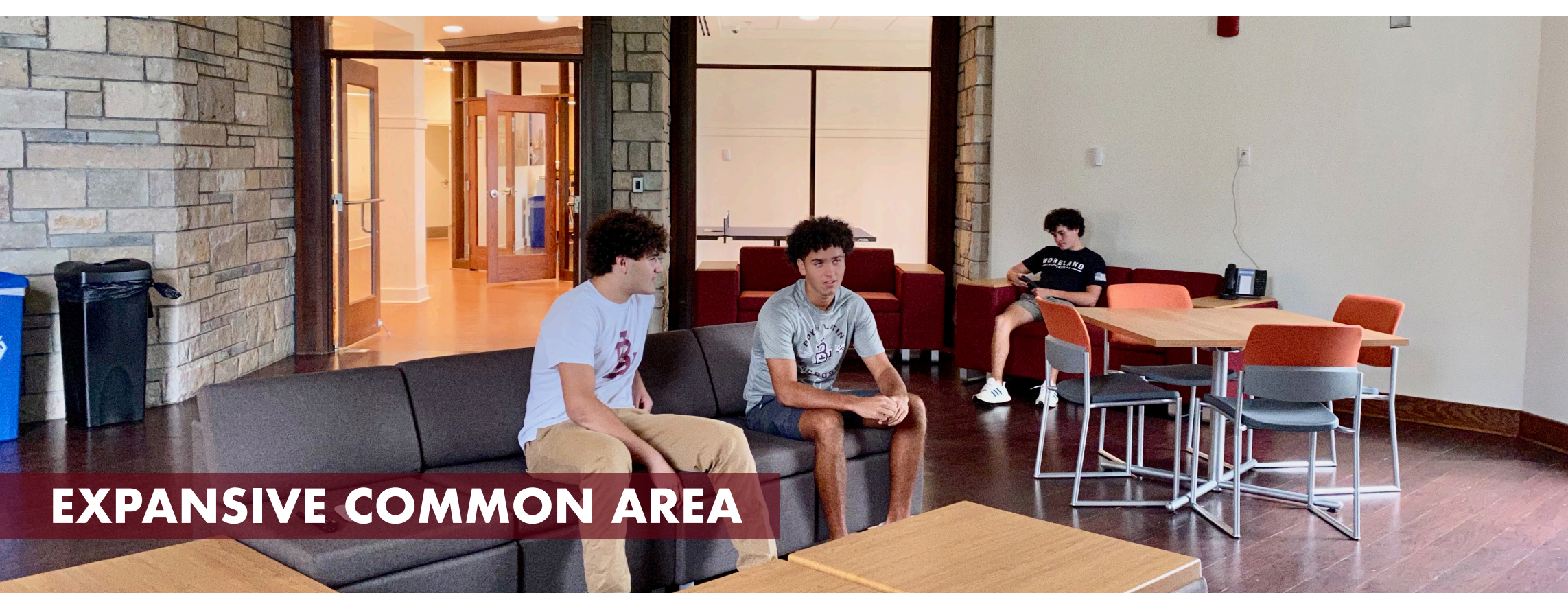
EXPANSIVE COMMON AREA