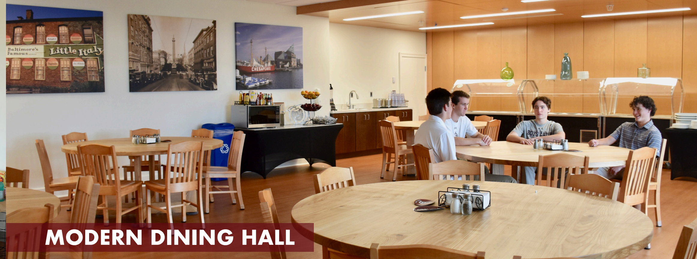
MODERN DINING HALL